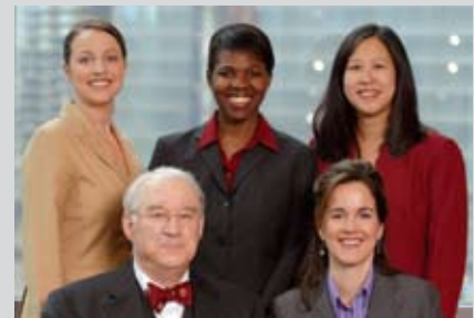
Office of Gift Planning Staff (Pictured left to right)

Many thanks to those who have arranged a planned gift to ensure continuing support for the University and its students.